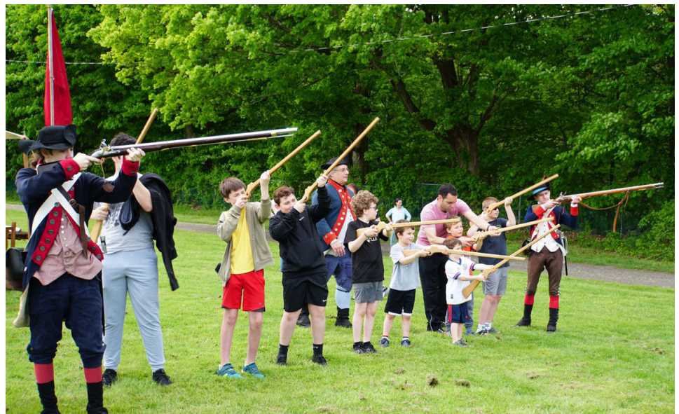
Attendees at the Rochambeau Festival took aim and tried out their form with fake muskets.