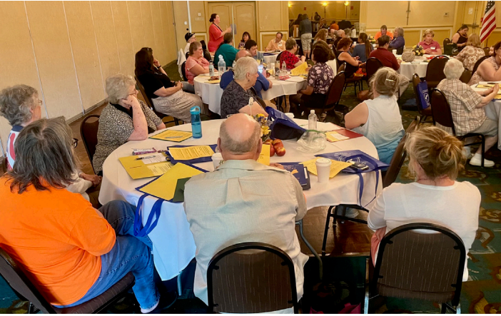
Grangers participate in one of the workshops presented at NELA.

Grange Lecturers. These included sessions on G.R.I.T 101, the Heirloom Program, artificial intelligence, community service, marketing, and membership. Expert speakers and experienced Grange members led the workshops, providing valuable insights and practical advice. Attendees particularly appreciated the interactive nature of the workshops, which allowed them to engage in discussions, share experiences, and ask questions.