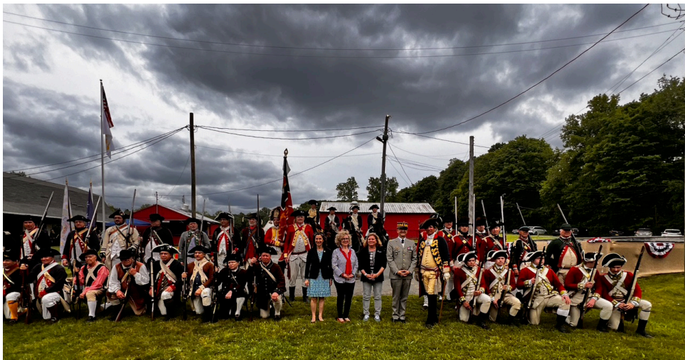
The second annual Rochambeau Festival was held on the Yorktown Grange Fair Grounds.